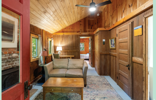
Fernwood's living room with vaulted ceiling and fan