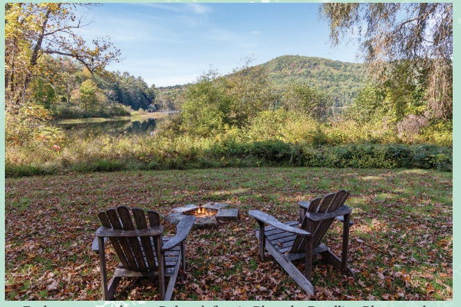
Early autumn colors at Balsam's firepit.

Happy New Year! Time is flying past - it's hard to believe but the holidays have come and gone and we're already getting closer to the sun. We're hoping for a snowy ski season, but summer will be here before we know it. Our 102nd season was truly memorable, and we're making great progress towards our plans of moving and renovating the barn.