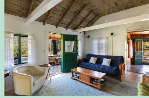
Balsam's newly upgraded living room