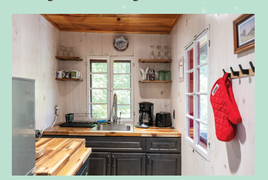
Edgewood's new kitchenette

first time; Fernwood now includes a gas heater, an upgraded kitchen, all-new windows and insulation, and vaulted ceilings in the living room. Here are some pics of the work completed so far: